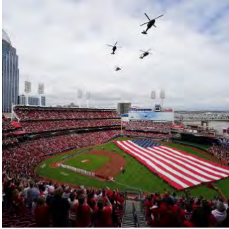
Reds Opening Day, Hope Springs Eternal!

Below is a list of legislative measures of interest, divided into six main topics: fiscal measures, general municipal issues, education measures, fishery & resource issues, energy matters, and election & voting issues. House measures are first, followed by Senate proposals. Companion bills are listed together. Priority focus will be on those likely to get traction. Happy to address other measures if asked. Information about these measures can be found at Alaska Municipal League Legislative Tracker or Alaska State Legislature . Check out what your legislators are doing. New bills are in BLUE, change in status in RED, and passed bills in GREEN.