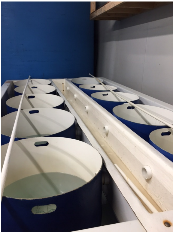
Alutiiq Pride Shellfish Hatchery in Seward