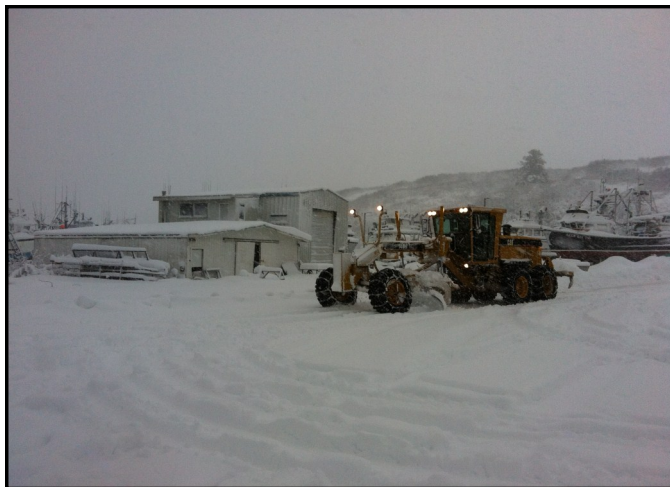
Public Works crew clearing the harbor parking lot after the big snow storm.

The Public Works crew has been staying on top of the roads and icy conditions. We apologize