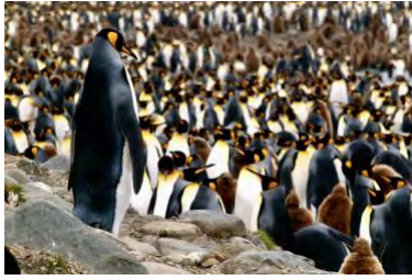
Governor Dunleavy's State of the State Address scheduled for Monday, January 29 at 7 PM.

Below is a list of legislative measures of interest, divided into six main topics: fiscal measures, general municipal issues, education measures, fishery & resource issues, energy matters, and election & voting issues. House measures are first, followed by Senate proposals. Companion bills are listed together. Priority focus will be on those likely to get traction. Happy to address other measures if asked. Information about these measures can be found at Alaska Municipal League Legislative Tracker or Alaska State Legislature . Check out what your legislators are doing. New bills are in BLUE, change in status in RED, and passed bills in GREEN.