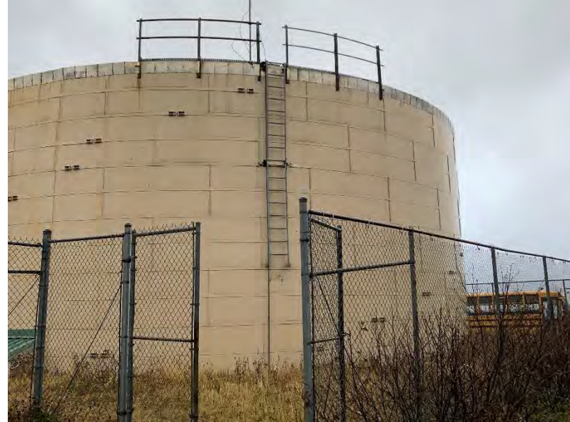
Photo 4. Broken water tank ladder