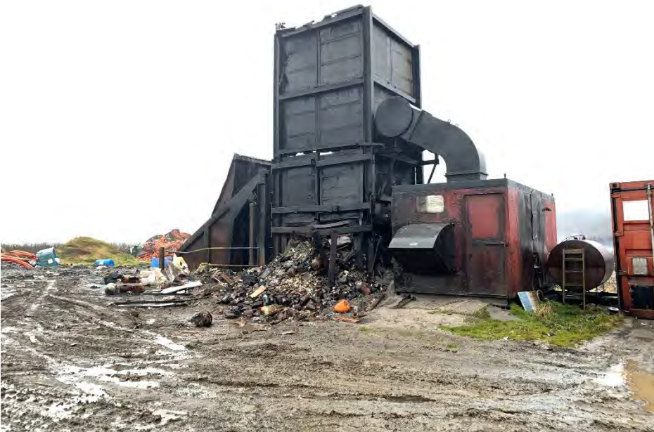
Photo 1: Damaged incinerator doors and evidence of burning of prohibited items.