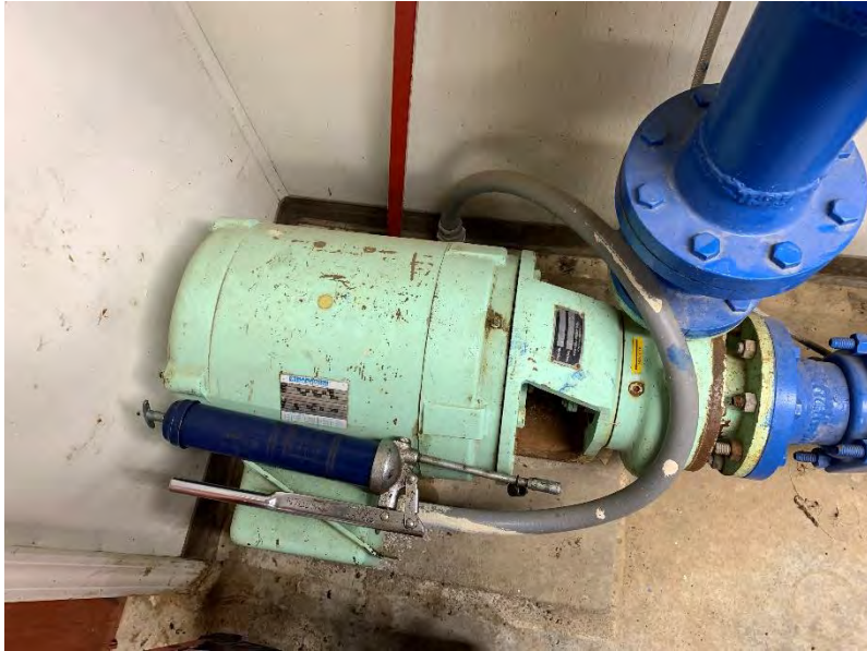
Photo 6. Nonfunctional booster pump at school pump house