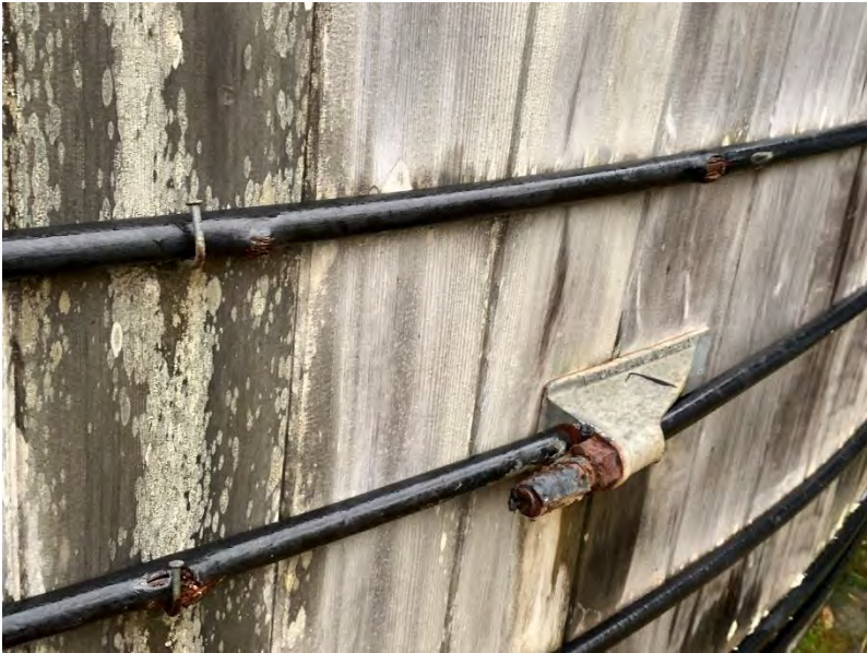
Photo 3. Splitting water tank strap