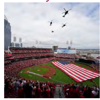
Reds Opening Day, Hope Springs Eternal!

Below is a list of legislative measures of interest, divided into six main topics: fiscal measures, general municipal issues, education measures, fishery & resource issues, energy matters, and election & voting issues. House measures are first, followed by Senate proposals. Companion bills are listed together. Priority focus will be on those likely to get traction. Happy to address other measures if asked. Information about these measures can be found at Alaska Municipal League Legislative Tracker or Alaska State Legislature. Check out what your legislators are doing. New bills are in BLUE, change in status in RED, and passed bills in GREEN.