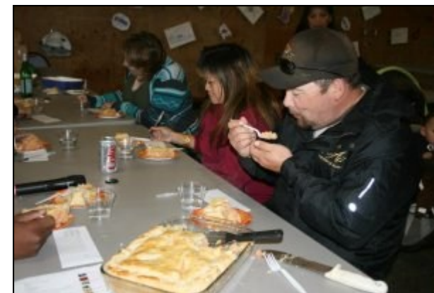
Judges testing for the best fish pie.