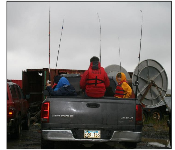
Kids heading to the fishing grounds.