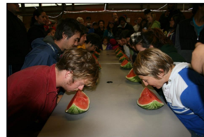
Watermelon eating contest!