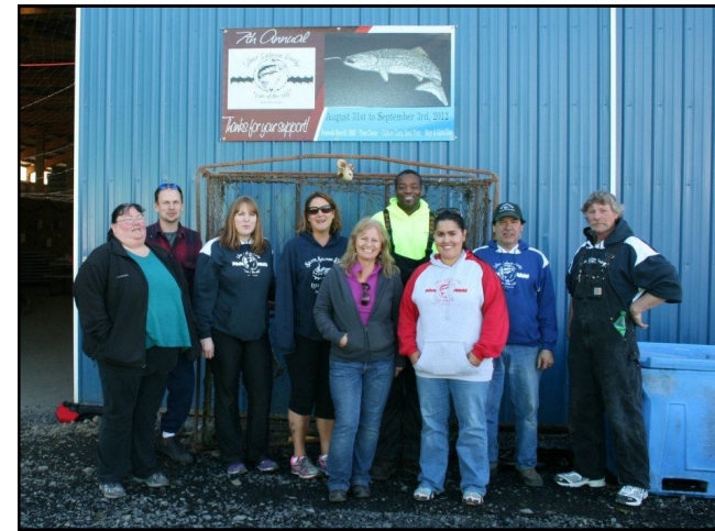
The Silver Salmon Derby committee.