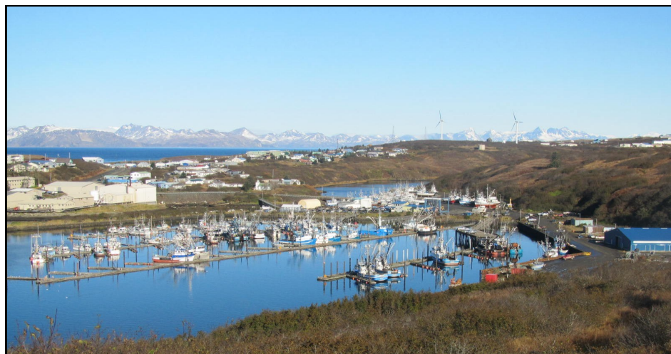
Robert E. Galovin Small Boat Harbor— October 2012.