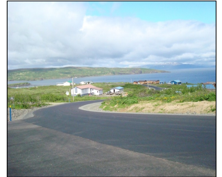
View from the school parking lot with the new pavement.