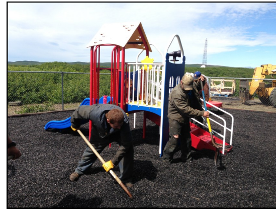
Public Works assisting with Head Start playground.

As the weather permits, we will assist in the assembly of the new City playground equipment and footing. While the new addition to the playground is being constructed, for you and your